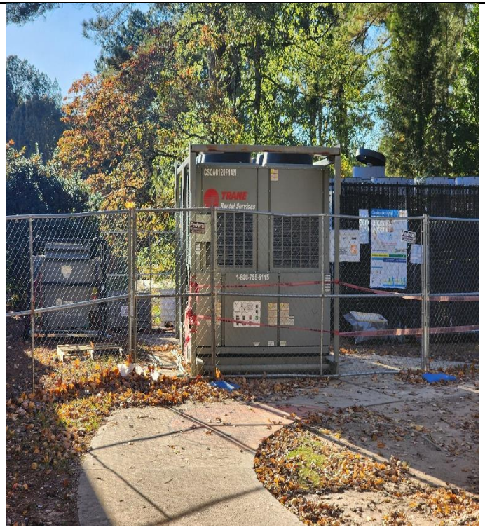
Preparation to replace the existing Chiller