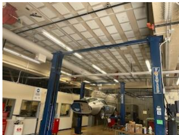
Fire Sprinkler line replacement work.