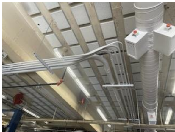
Fire Sprinkler lines were raised in the Auto Lab.