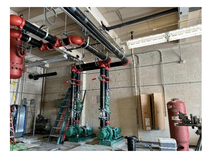
New equipment at the Boiler Room.