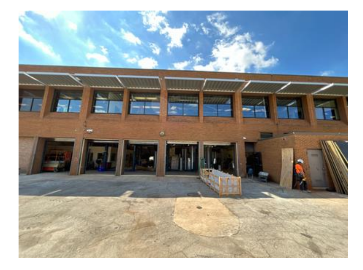
New windows and canopies on the building's south side.